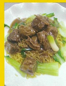
Beef Brisket Noodle