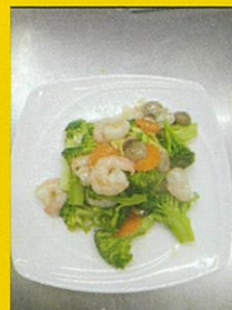
King Prawn with Broccoli