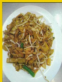
Fried Kway Teow