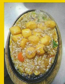
Sizzling Japanese Tow Fu