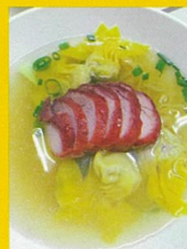
Char Sui Wonton Mee Soup