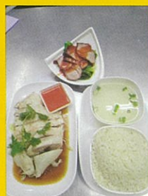
Hainan Chicken Rice